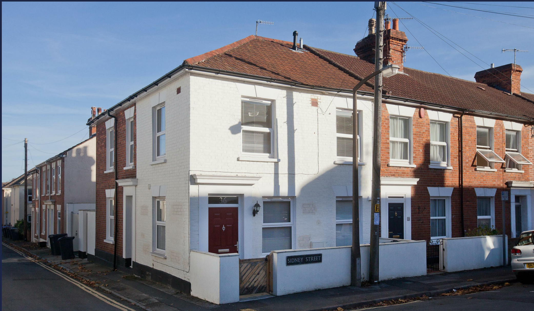
36 Sidney Street, Salisbury